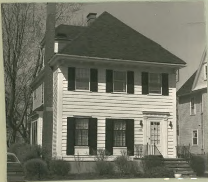
12. PHOTO: 27-23a