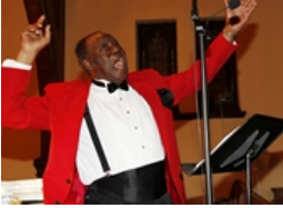
(http://www.buffalonews.com/story/image/BN/20141116/CITYANDREGION/141119157/EP/1/2/EP-141119157.jpg&maxW=960) Story image/BN/20141116/CITYANDREGION/141119157/EP/1/2/EP-141119157.jpg&maxW=960