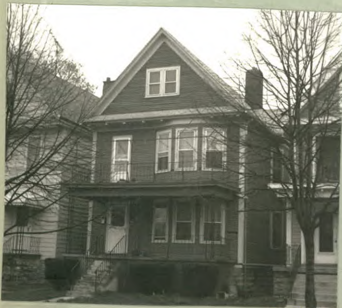
12. PHOTO: 38-32a