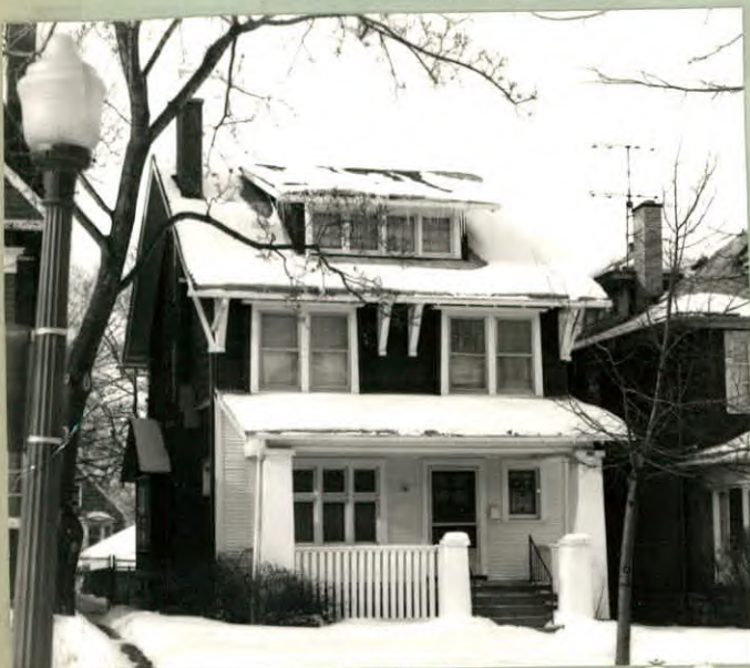
12. PHOTO: 20-30a