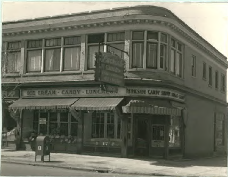
12. PHOTO: 29-19a & 36-11a