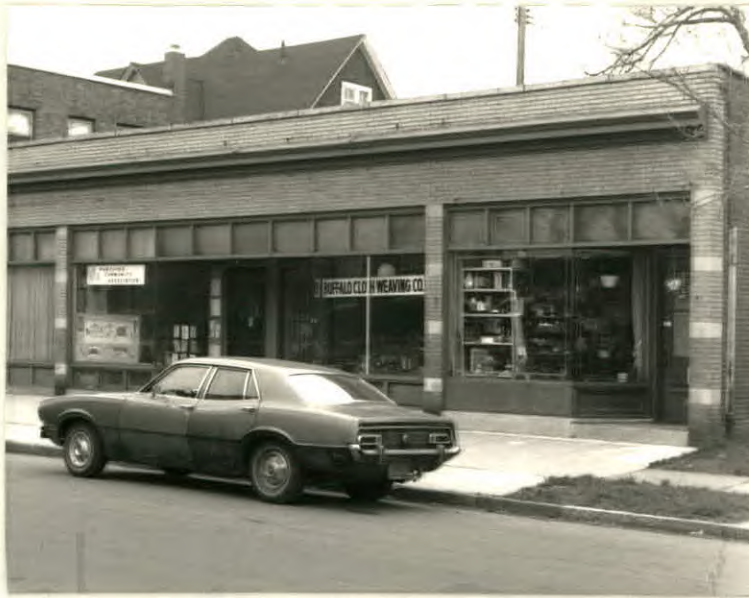
One-story Oakwood addition (6-14 W. Oakwood)

18. (cont.) door. Advertising band trim above windows. Cast metal entablature spans entire first floor. Egg and dart motif below cornice. Second floor corner windows; center slender double-hung 1/1 window flanked by two single-light windows. Square transom lights. Main Street facade second floor has band of single-light windows with 4-light transoms. Cast metal entablature spans entire building. Egg and dart and modillions under cornice. Stone capped parapet. Oakwood facade first floor end bay has glass paneled recessed door flanked by single light commercial glass window with three-light transom. Second floor has a series of double-hung 1/1 windows. One-story addition on Oakwood has recessed glass paneled doors with single-light glass windows flanking. Five-light transoms. Piers with stripped stone bands flank commercial fronts. Metal cornice. Stone capped parapet.