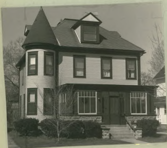
12. PHOTO: 27-21a