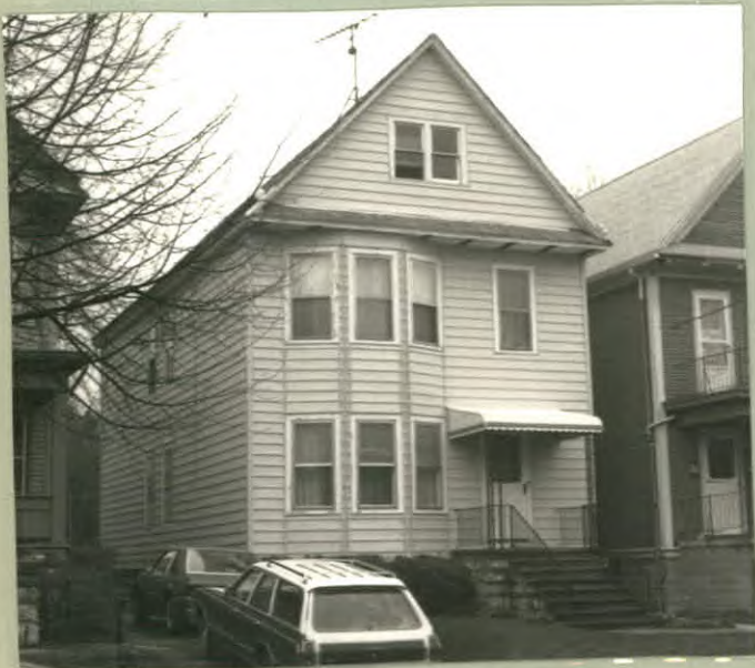
12. PHOTO: 38-33a