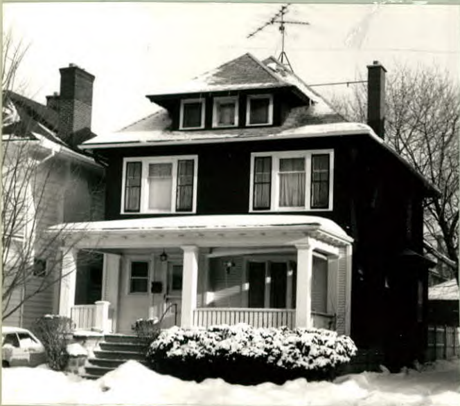
12. PHOTO: 23-21a