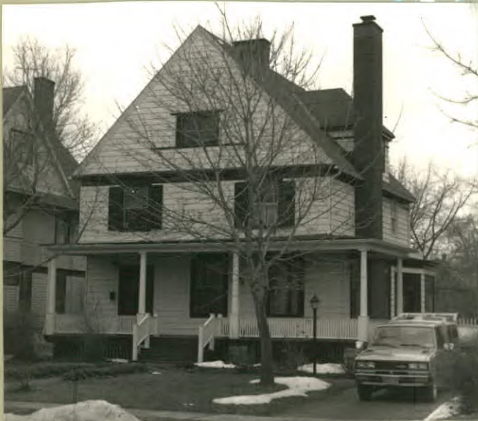
12. PHOTO: 26-7a