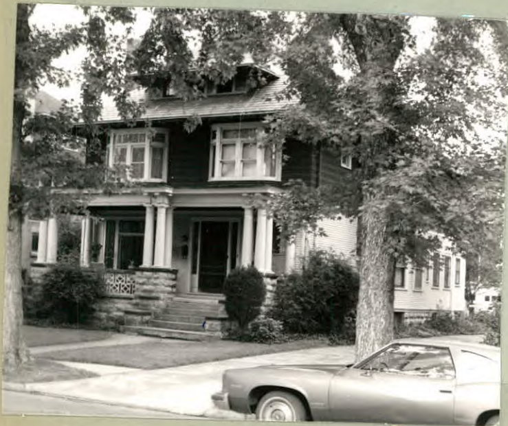
12. PHOTO: 9-14a