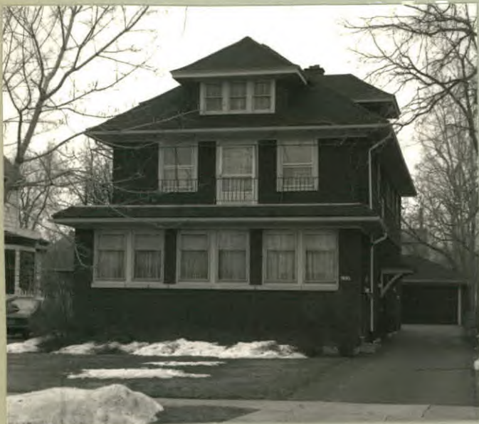
12. PHOTO: 26-6a