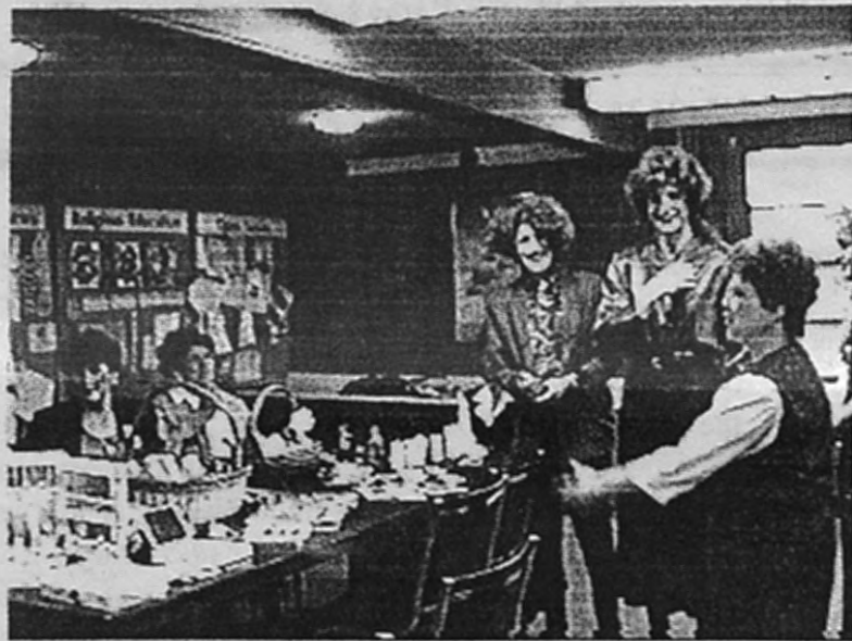
MARY KAY PRODUCTS ON DISPLAY