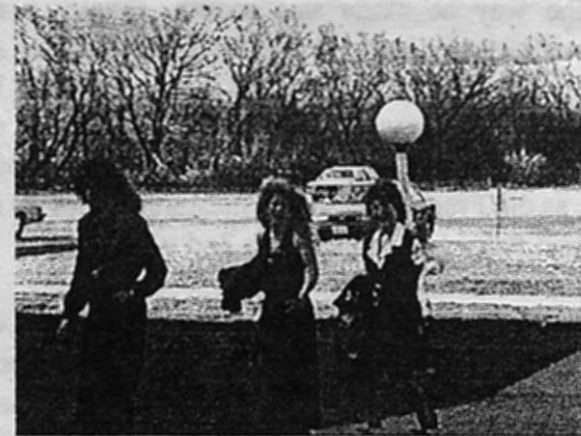
SOME OF OUR LADIES ARRIVING