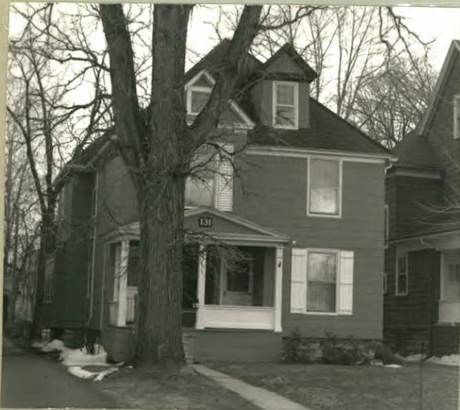
12. PHOTO: 26-5a