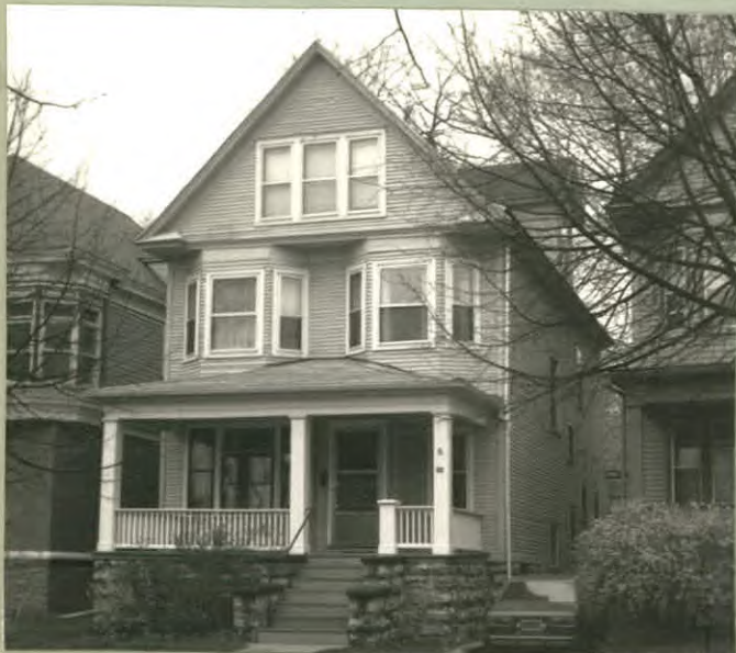
12. PHOTO: 38-35a