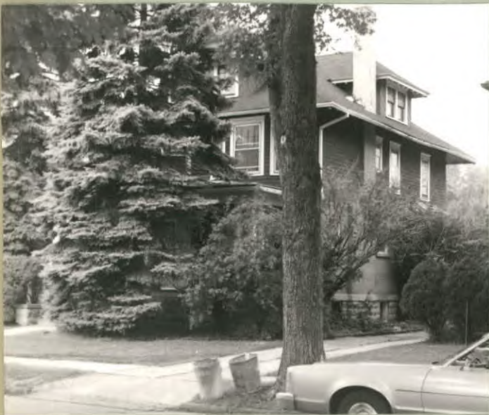
12. PHOTO: 9-15a