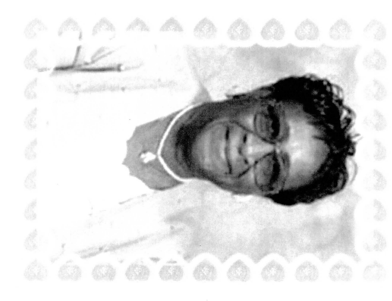
Hways in Our Hearts ...