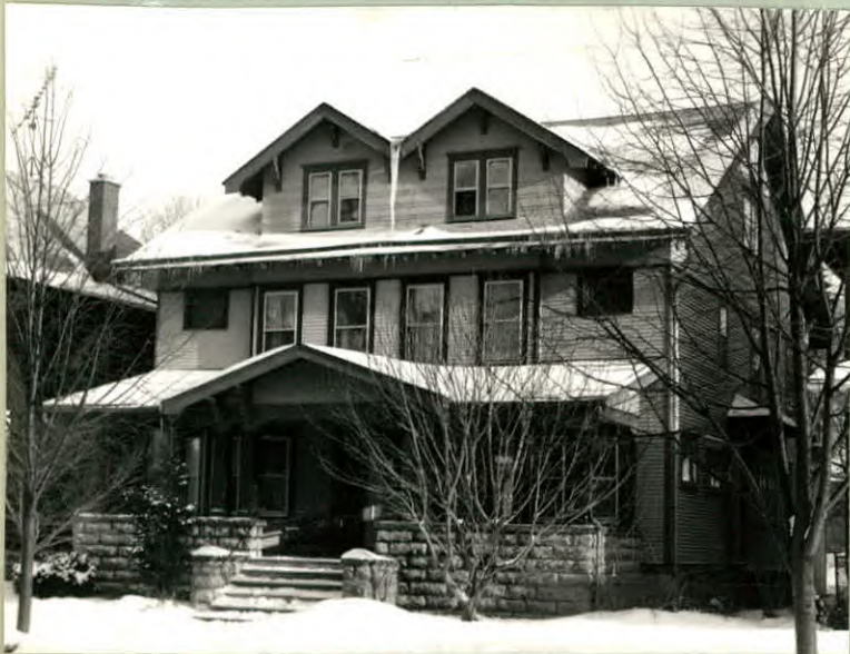
12. PHOTO: 23-20a