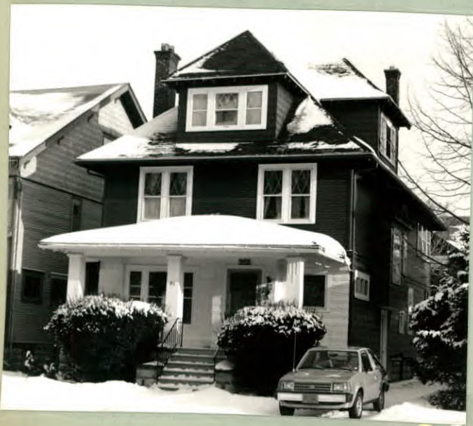
12. PHOTO: 23-19a