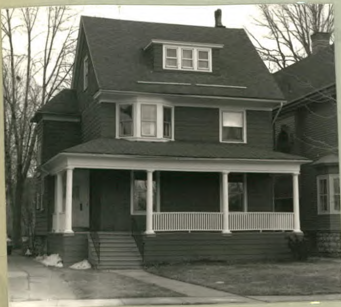
12. PHOTO: 26-4a