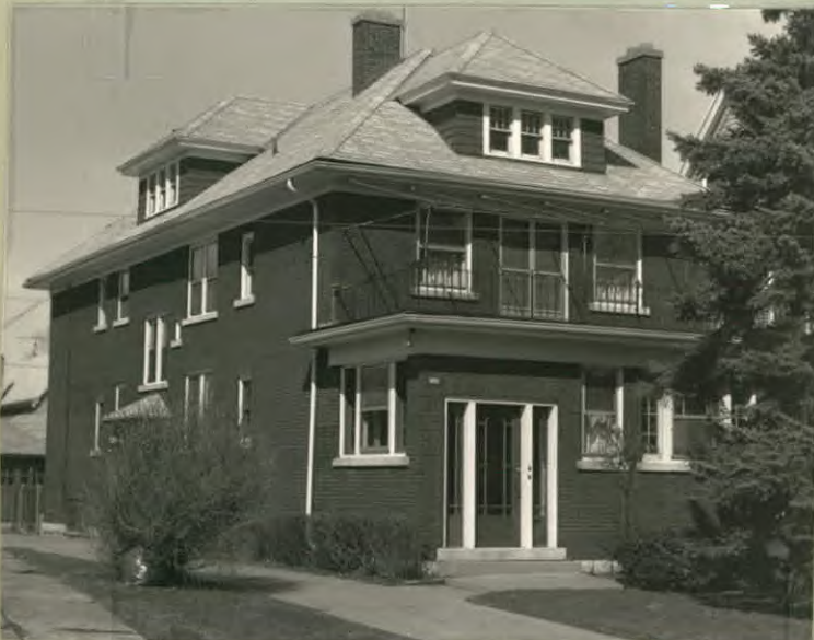
12. PHOTO: 27-18a