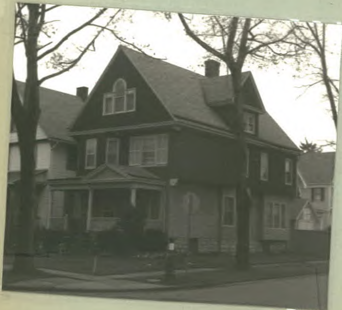
12. PHOTO: 38-9a