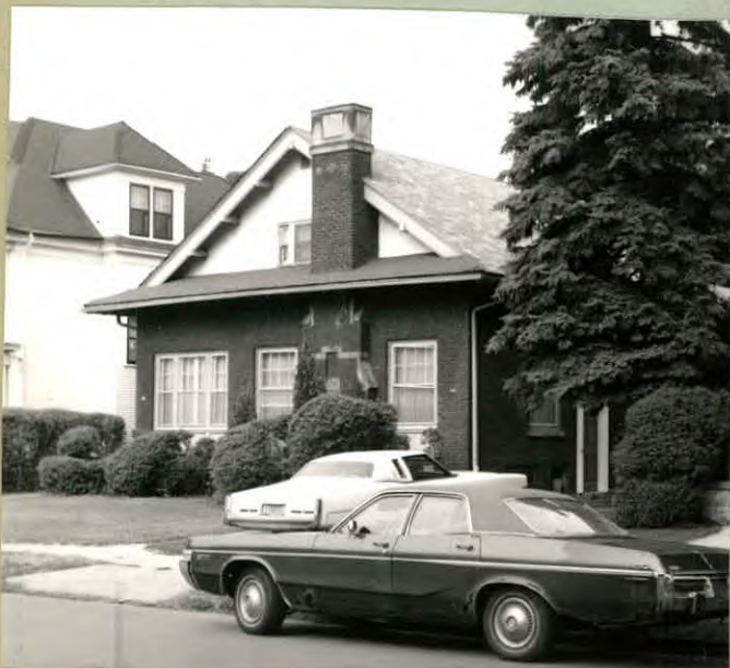
12. PHOTO: 9-16a