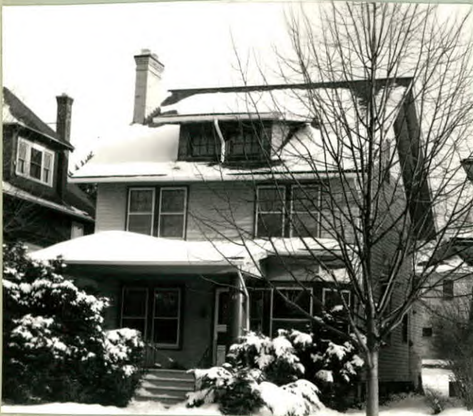
12. PHOTO: 23-18a