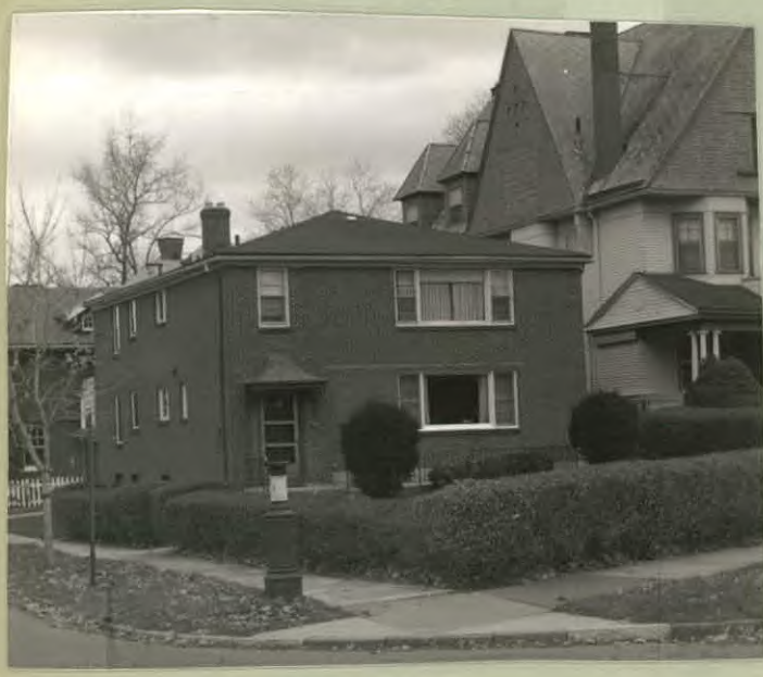
12. PHOTO: 18-26a