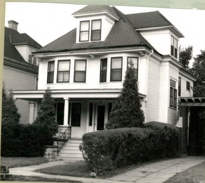
12. PHOTO: 9-17a