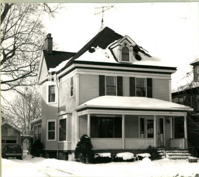
12. PHOTO: 20-25a