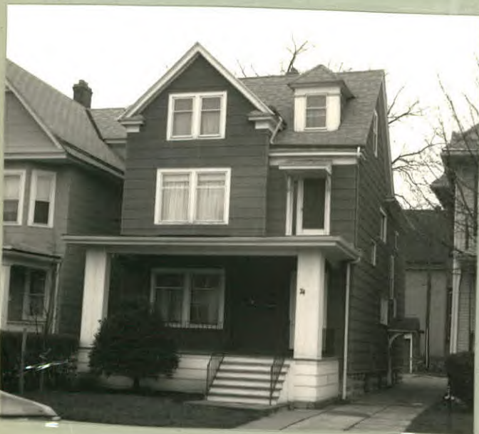
12. PHOTO: 39-1a