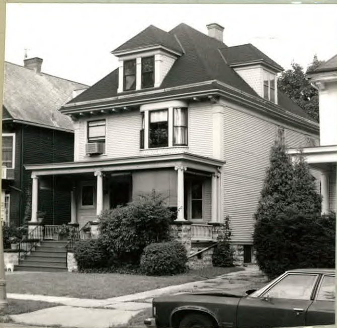
12. PHOTO: 9-18a