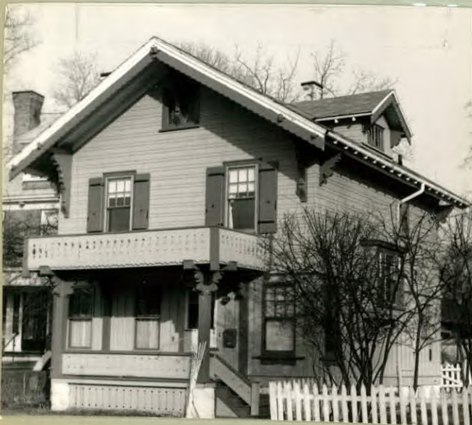
12. PHOTO: 25-35a