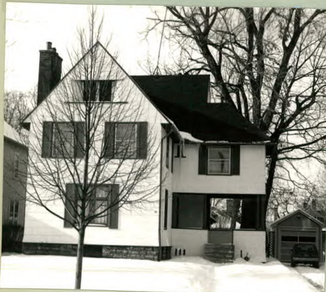
12. PHOTO: 20-24a