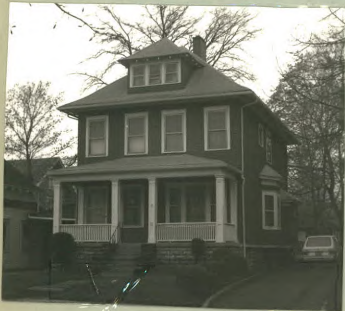
12. PHOTO: 38-8a