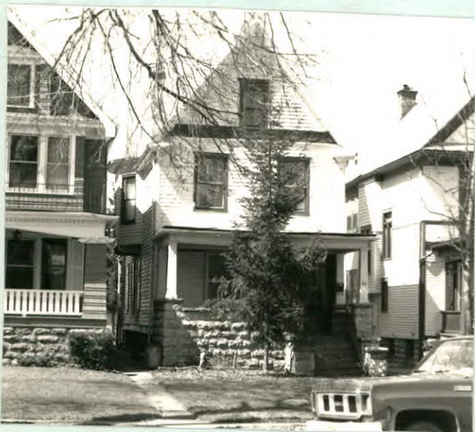
12. PHOTO: 31-11