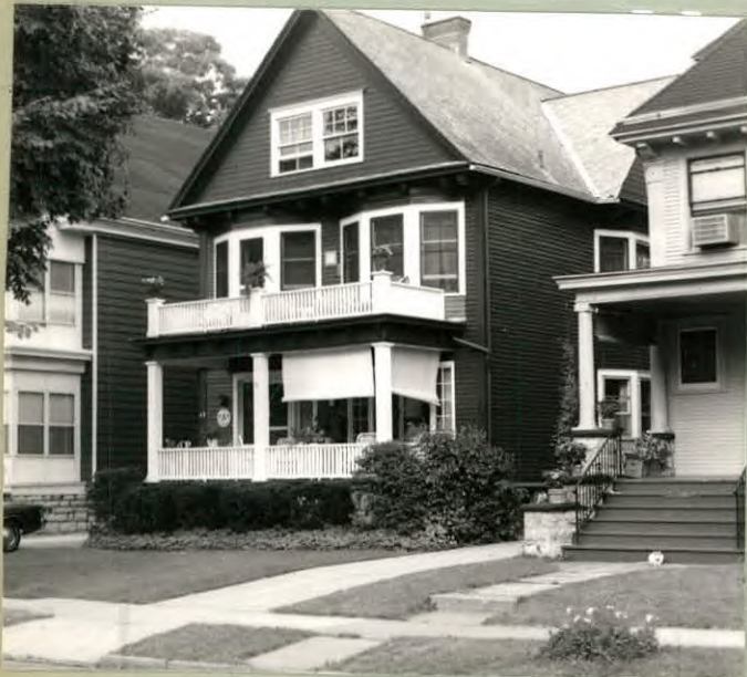
12. PHOTO: 9-19a