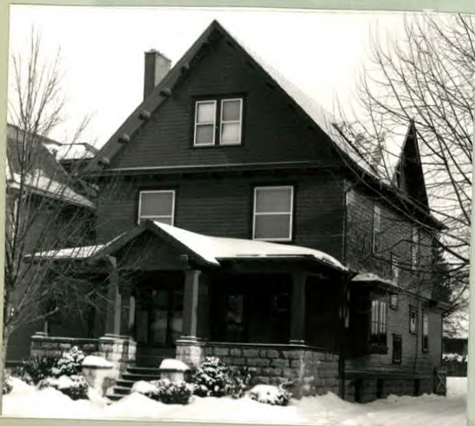
12. PHOTO: 23-15a