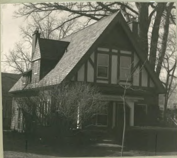
12. PHOTO: 27-14a