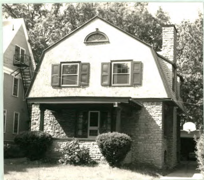
12. PHOTO: 30-7a