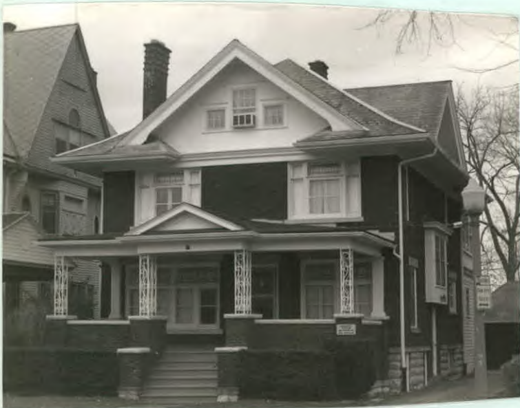
12. PHOTO: 18-24a