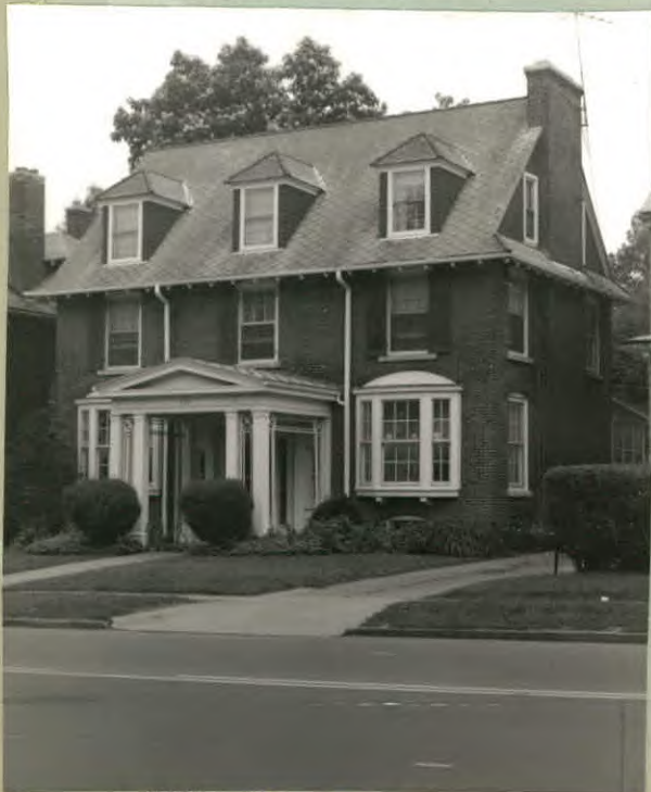
12. PHOTO: 13-4