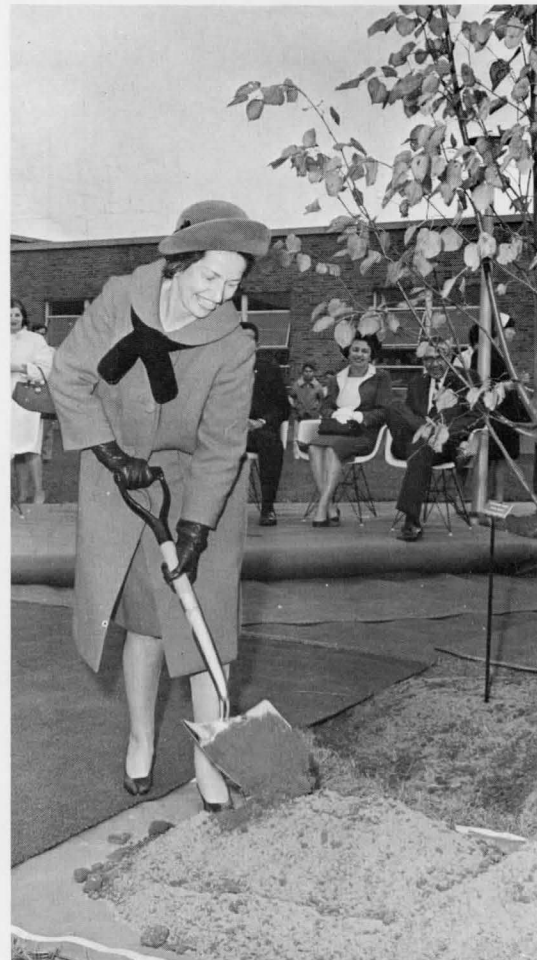
Mrs. Lyndon B. Johnson