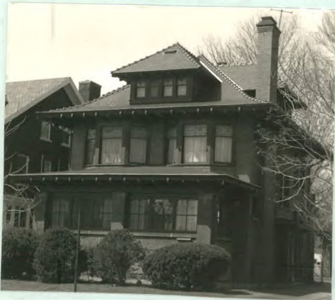
12. PHOTO: 29-3a