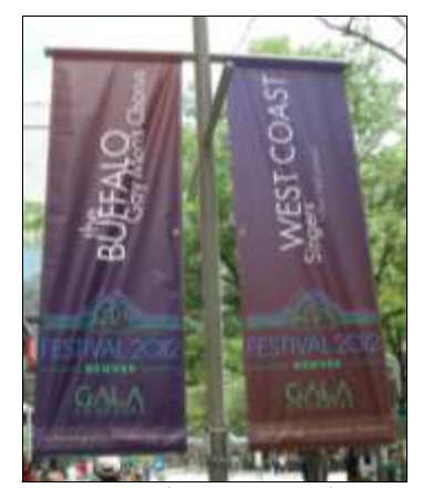
BGMC banner on the 16th St. Mall in Denver