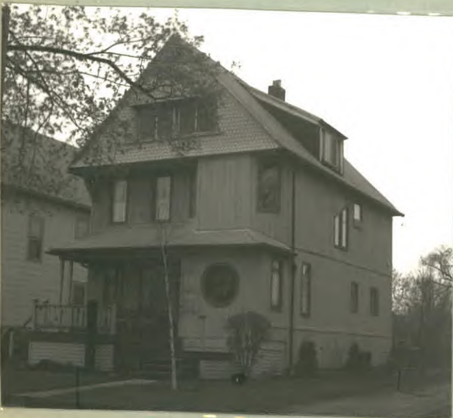
12. PHOTO: 38-6a