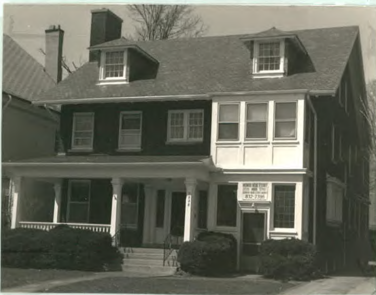
12. PHOTO: 29-2a