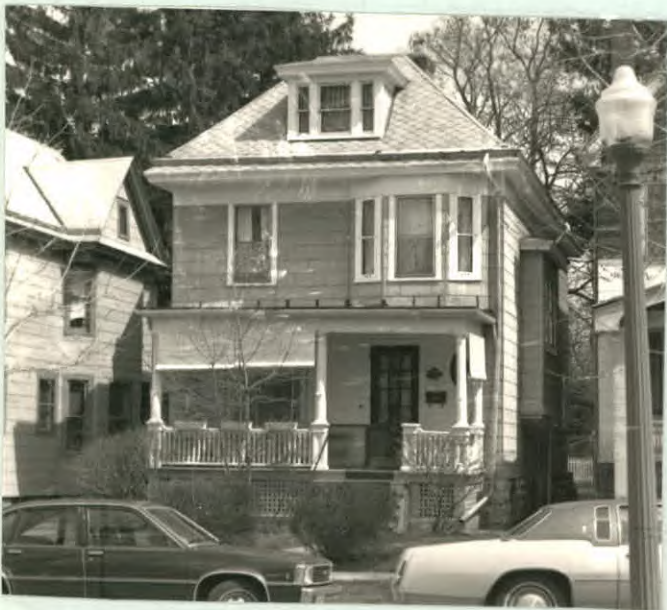
12. PHOTO: 32-13a