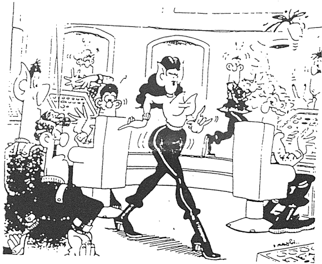
THAT'S ALL WE NEED ON THE ENTERPRISE, A VULCAN CROSSDRESSER.