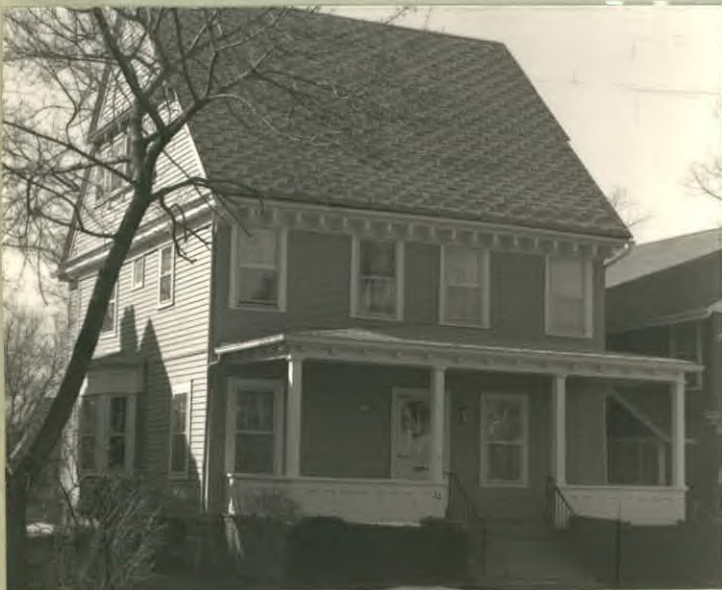
12. PHOTO: 27-11a