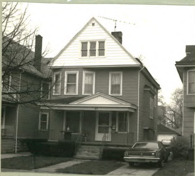
12. PHOTO: 39-5a