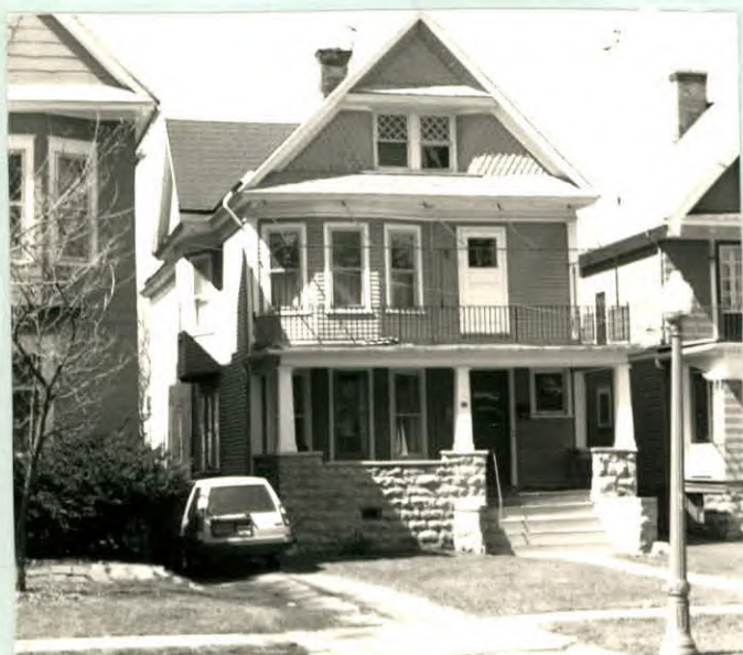
12. PHOTO: 31-9