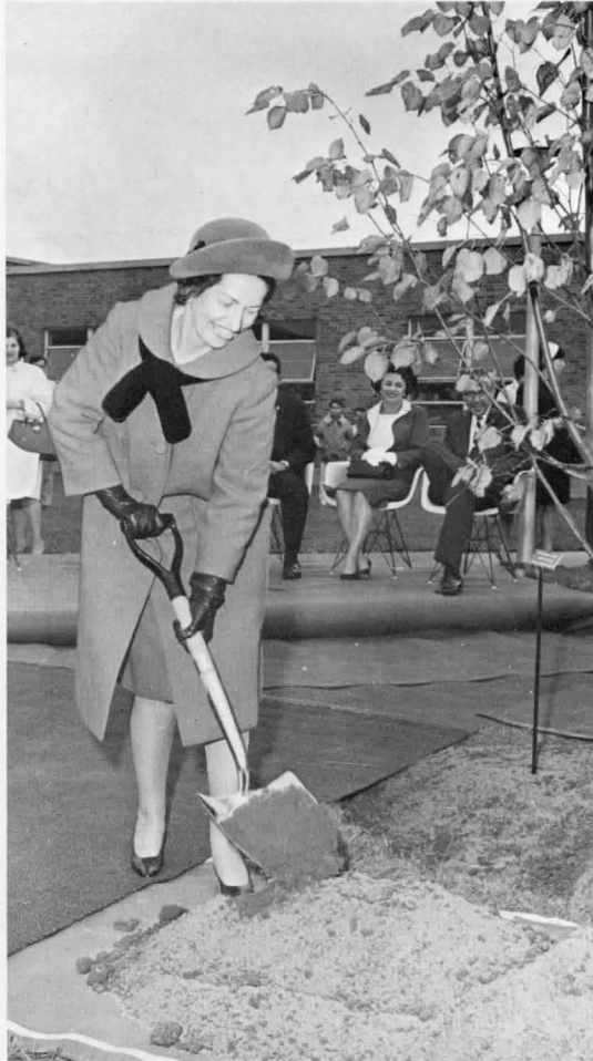
Mrs. Lyndon B. Johnson