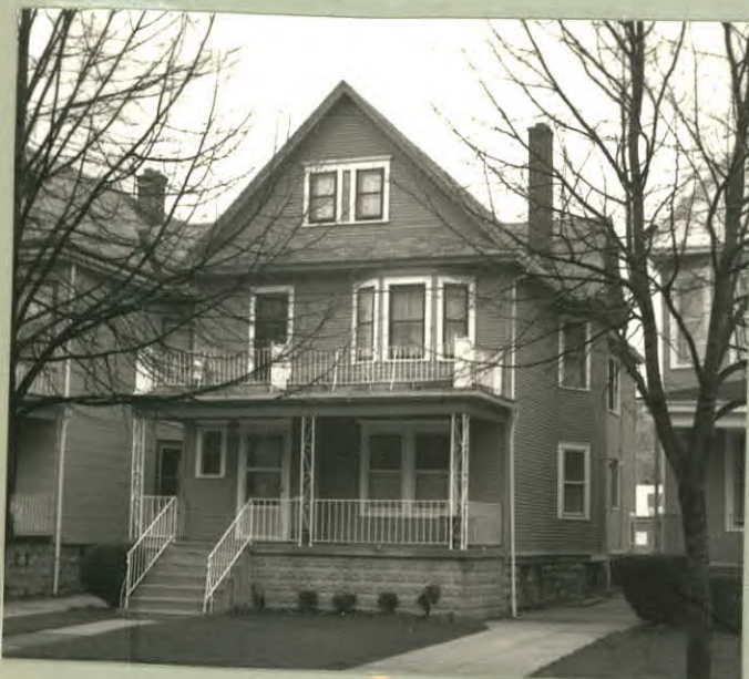
12. PHOTO: 39-6a